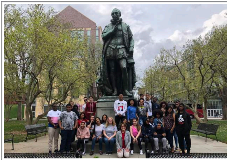
Students visiting Rutgers University while on their trip to New York and New Jersey.